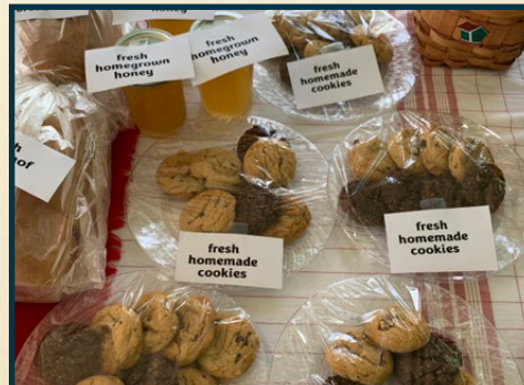
Bottom right: Some of the homemade baked goods auctioned off at homecoming.